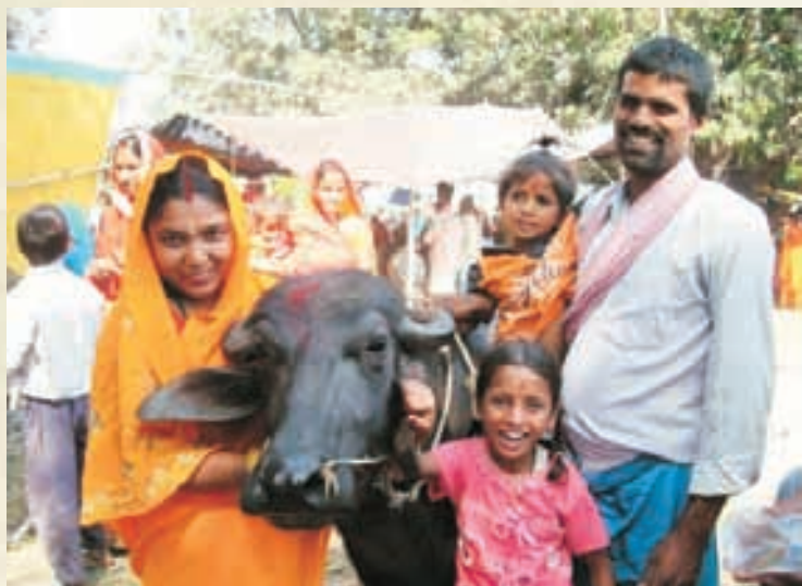
A joyous family at a pass-on ceremony at Rautahat

resources challenge development initiatives to a great extent. In sync with the activities of the month the staff of Heifer contributed and facilitated additional 25 scholarships to needy children. The Bridge Club Nepal contributed in the festivities by donating clothes for children. The clothes provided were distributed in project families in Rautahat, Parbat, Baglung, Tanahun, and Sunsari.