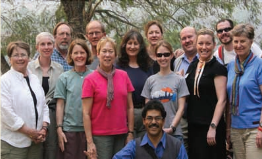
Participants pose for a group picture at scenic and soothing Kurintar

Heifer Nepal hosted a study tour from 13-23 March, 2009 for 14 participants consisting of Heifer Volunteers and Heifer International staff members. The ten day tour through Heifer Nepal's project sites in Baglung, Tanahu, Chitwan and Nawalparasi included group interactions, home visits, a passing on the gift ceremony and the usual song and dance sessions, typical of a Nepali culture. The participants witnessed the impacts of Heifer's efforts. With heavy hearts, women recited the tale of the hardships of rural life along with the challenges like caste, race and gender discrimination, lack of resources and awareness. With bright faces and glory they talked of Heifer's gifts of livestock and training and how it changed them and their lives. Attending the Passing on the Gift ceremony at Vijaynagar wove all the experiences